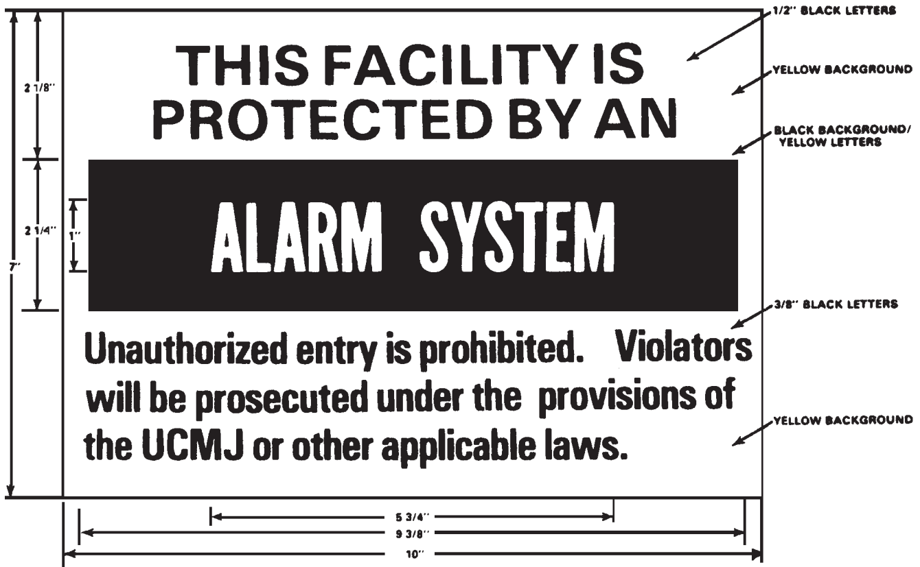
Figure F-1. Sample Intrusion Detection System sign